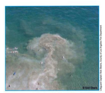
Rip currents sometimes generate a plume of visible sediment moving away from shore.