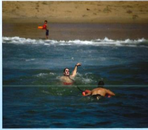
A lifeguard rescues a swimmer caught in a rip current.

CURRENTS BREAK THE GRID OF THE RIP RIP CURRENTS BREAKTHE GRIP OF THE RIP RIP CURRENTS BREAK THE GRIP OF THE R