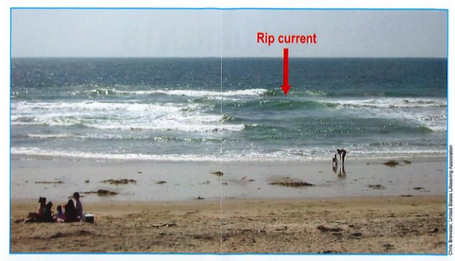
A narrow, darker gap between areas of breaking waves is one sign of a rip current.